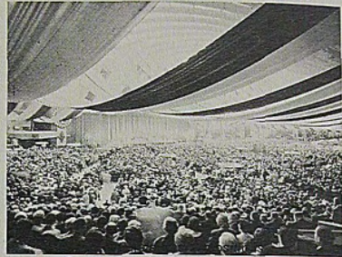
Convention du Rotary International

Centre Mondial des Congrès Carrefour Commercial et Ville Universitaire desservie par un aéroport international