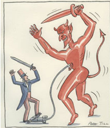
(used by Adam Curtis in the article cited above)